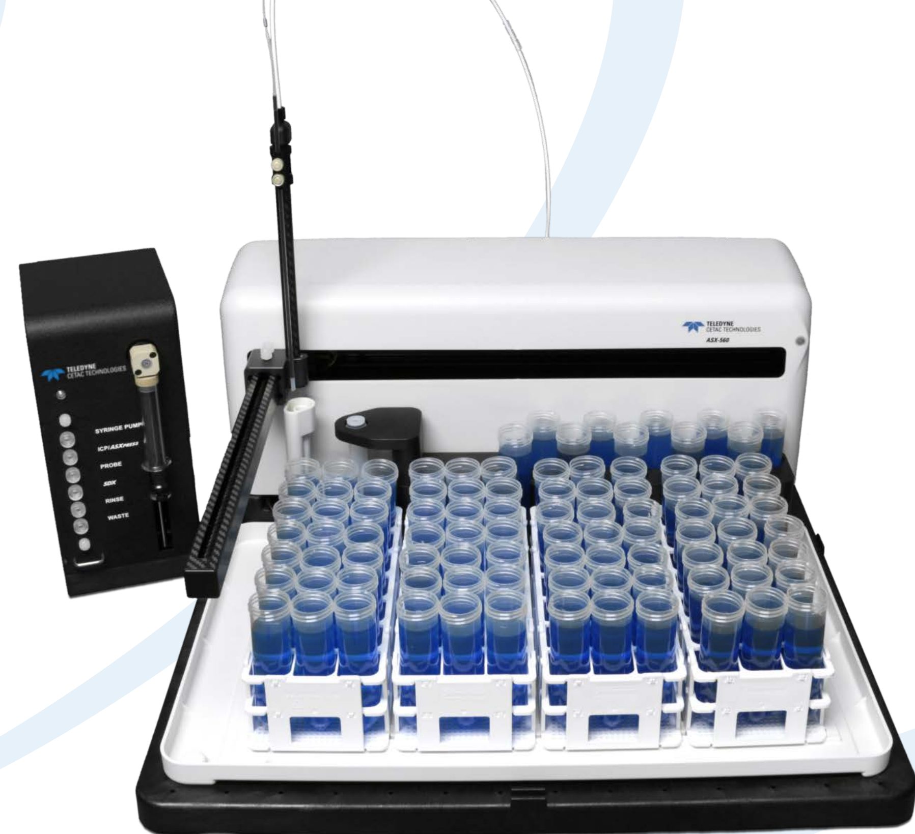
Teledyne CETAC Technologies SDXHPLD System

Sample dilutor: Teledyne CETAC SDXHPLD High Performance Liquid Dilution System